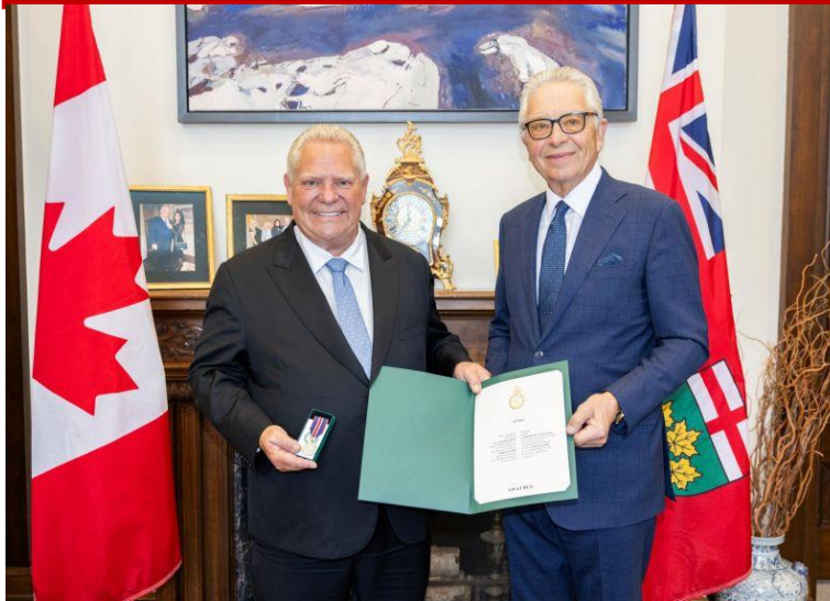
King Charles III Coronation Medal