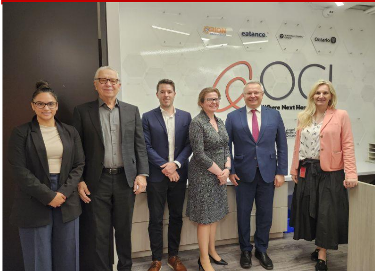
Working with Innovation Ontario